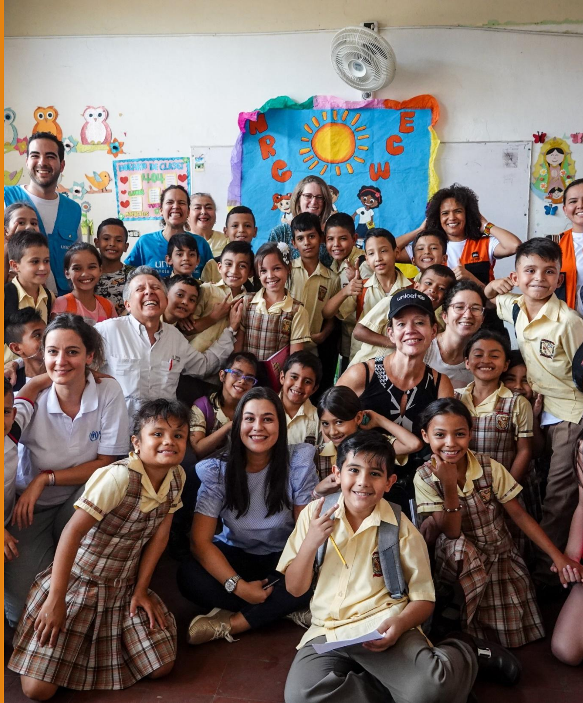
PHOTO: NRC, PLAN, SAVE THE CHILDREN, WORLD VISION, UNICEF WITH ECW & CHILDREN IN COLUMBIA